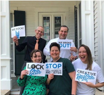
ESA Escape Room