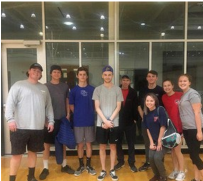
ESA Intramural Teams