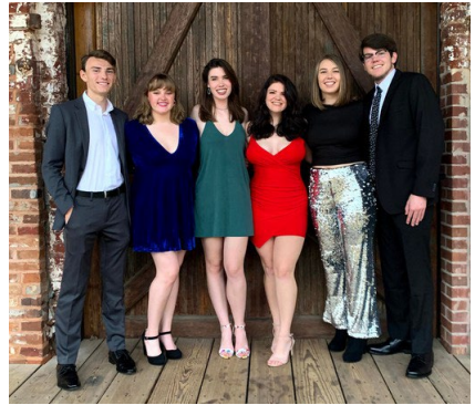
ESA Formal & Semi-Formal