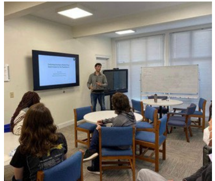
ESA Conference Prep Session