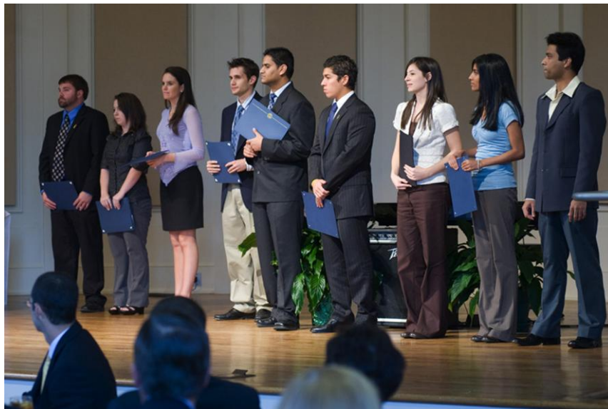
2008 Scholarship Recipients