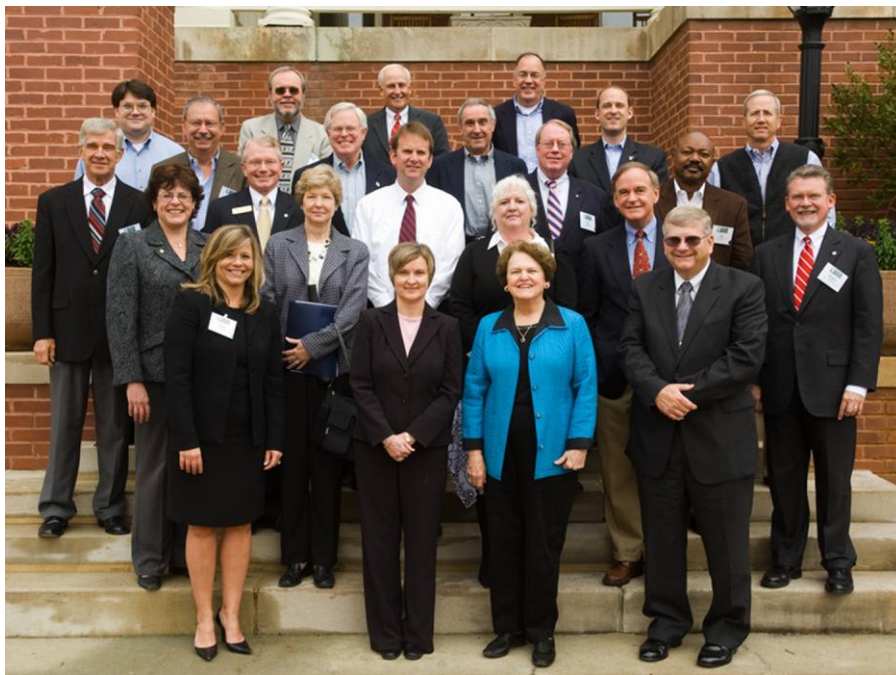
School of Business Advisory Board Members