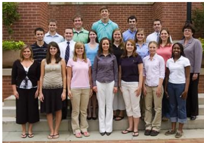
2007-2008 Dean's Student Advisory Board