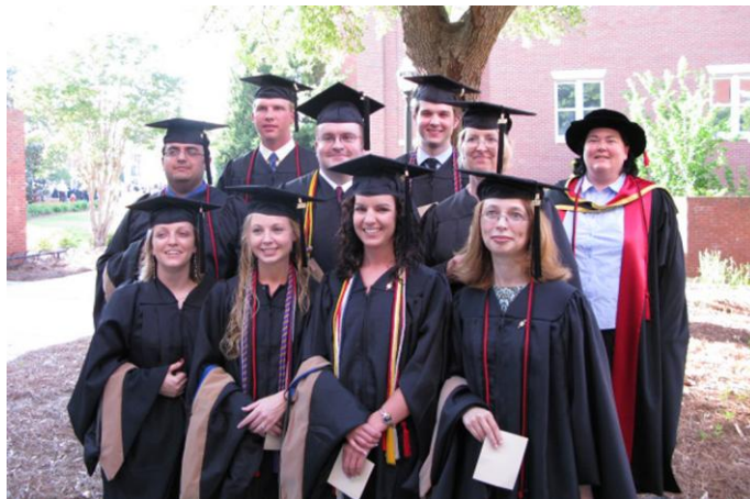
2008 Graduation – Master of Accountancy Students

Deactivated BBA programs with 2008 graduates are: Economics (1), International Business (14), Office Communication Systems (1), and Office Systems Administration (1).