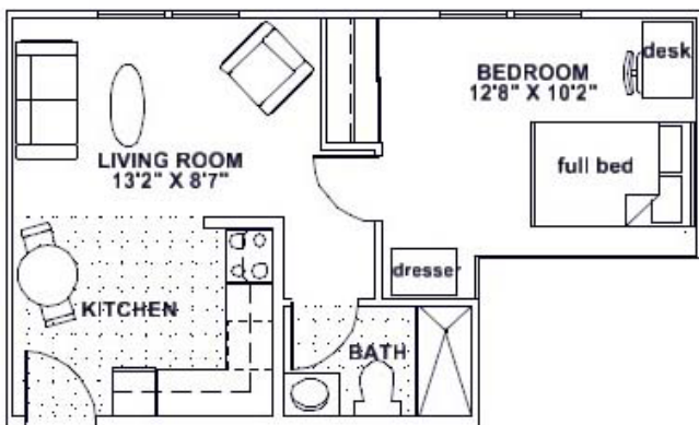
Building 4,5 and 6 1 bedroom