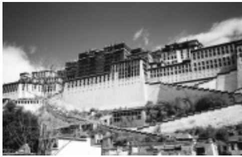
Potala Palace in Lhasa, Tibet