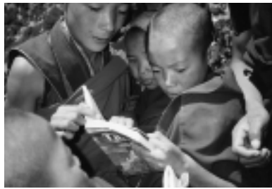
Young monks at Ganden Monastery high in the mountains are entranced as they look at photos of their monastery in Lonely Planet: Tibet.