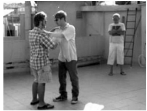
Rehearsing on the roof of the hotel in Thessaloniki, Greece

After 3 days in Montepulciano, I headed out on a long adventure to my next destination. After two trains, a ferry, three buses and a cab ride filled with some of the most remarkable landscapes on this earth, I arrived in Thessaloniki, Greece ( Hellas in Greek). Thessaloniki is the second largest city in Greece, second only to Athens, with remarkable diversity and vibrancy and located on the Aegean Sea.