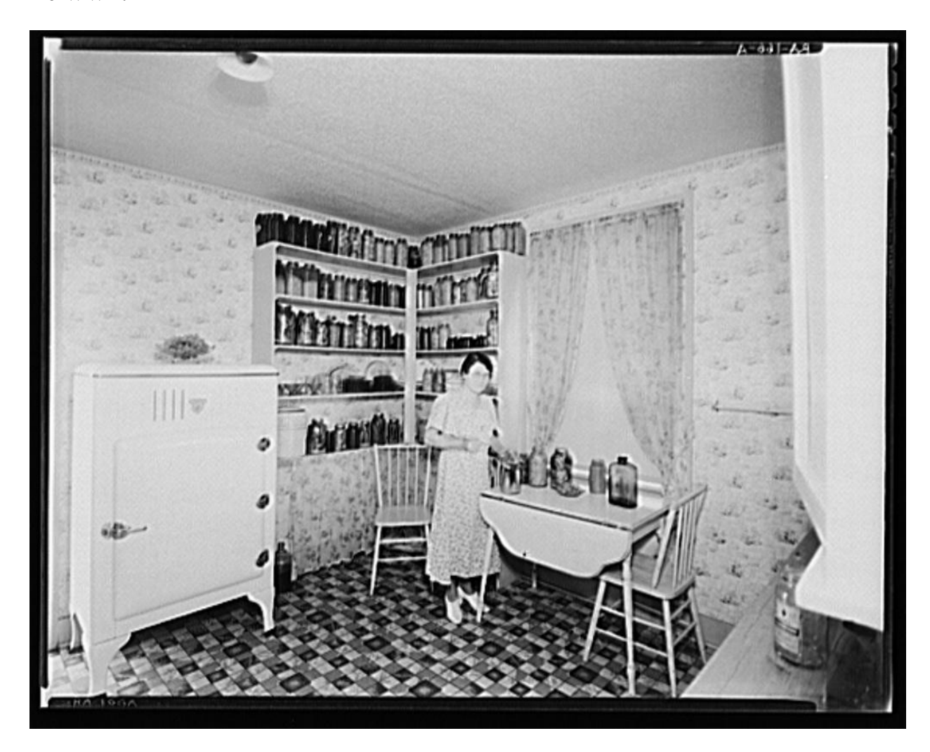
"Housewife canning, Dalworthington Gardens, Texas" - 1936

For many women whose occupation was to be a housewife, the kitchen was a key domestic sphere within their life. In addition to cooking and preparing the food for meals, they were also responsible for preparing preserves for the colder months of the year. The shelves behind her show that she had been quite productive in this process. Housewives spent most of their time within the home, while their husband went out to work and earn wages for the family.