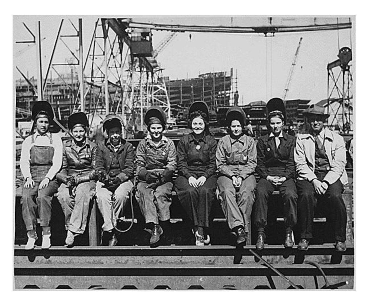
"Line up of some of women welders including the women's welding champion of Ingalls [Shipbuilding Corp., Pascagoula, MS]." 1943.

This is another example of women working industrial jobs while the men are away. Welding was not only a dirt and rough job, but was also quite dangerous. This would have been outside the traditional notions of what was acceptable for women to partake in prior to the war, however during this time of intense change, they stepped up to the plate. They are also in appropriate attire that allow for easy movement and support. Though also overseen by the man on the end, it is clear from his fedora hat and tie that he was not the one performing the hard labor; instead it was the women with their welding masks, work shoes, and coveralls who kept the line moving.