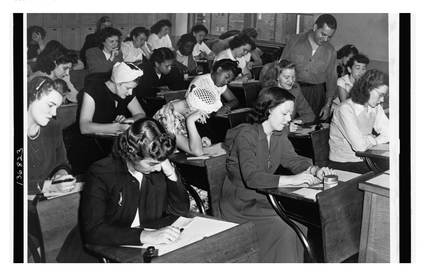
"[Women taking the qualifying exam for the New York City police force] " 1947

Immediately following the war, there was a shift for many women to return to the traditional gender roles they held before. However, many women fought to maintain the sense of freedom they held during WWII. This image shows women who are back in traditional dresses or attire deemed appropriate for women, however they are taking an exam to work for the NYC Police Force. Considered a serious and important job, these women are breaking away from the gender norms at the time.