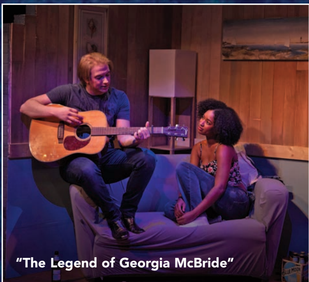
“The Legend of Georgia McBride”