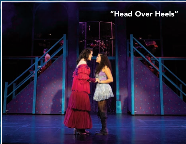
“Head Over Heels”