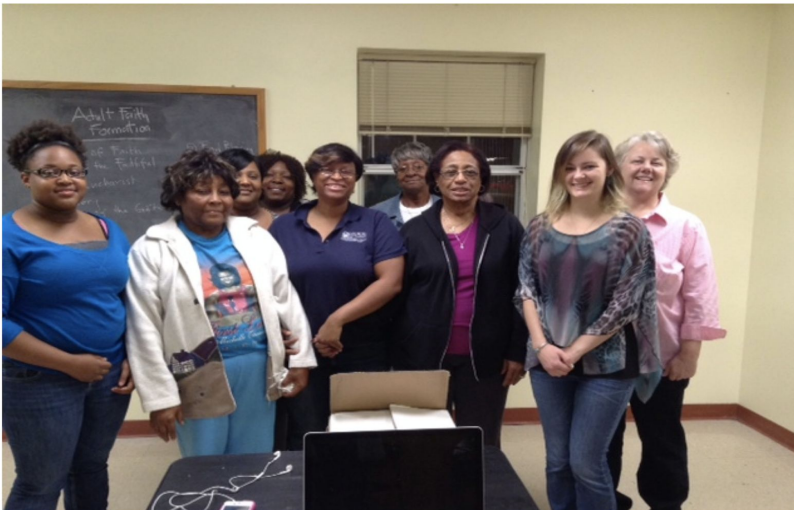
Women in computing at Georgia College work with local foster parents on internet safety