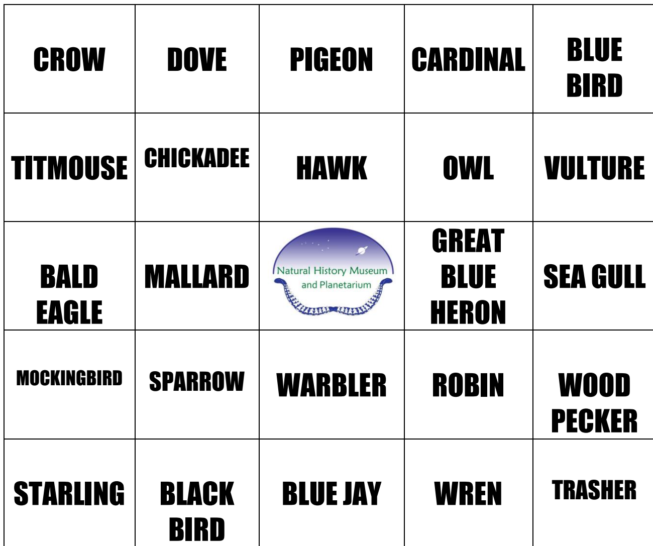
Southeastern Bird BINGO