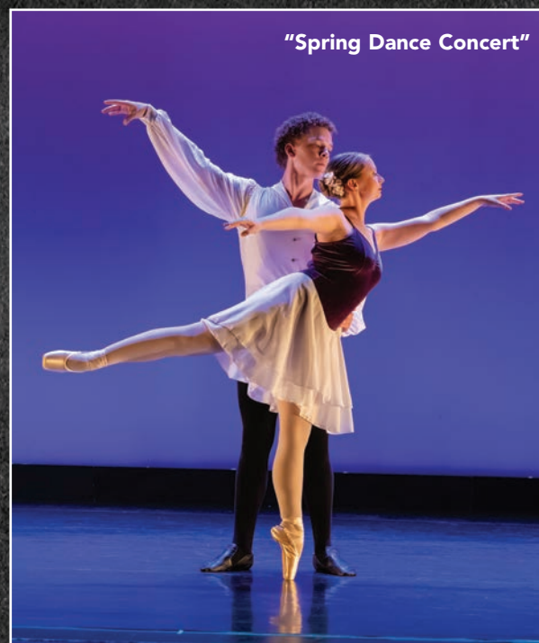
"Spring Dance Concert"