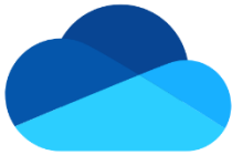
new OneDrive logo

Then your version will work with Teams. If the icon has 2 clouds like the one below: