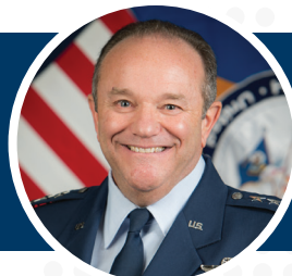
General Philip M. Breedlove

Supreme Allied Commander, NATO and General (ret.), U.S. Air Force