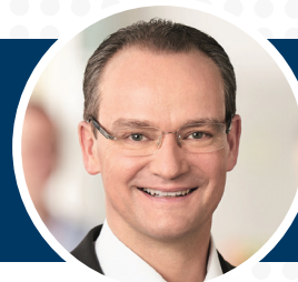
The Honorable Gunther Krichbaum