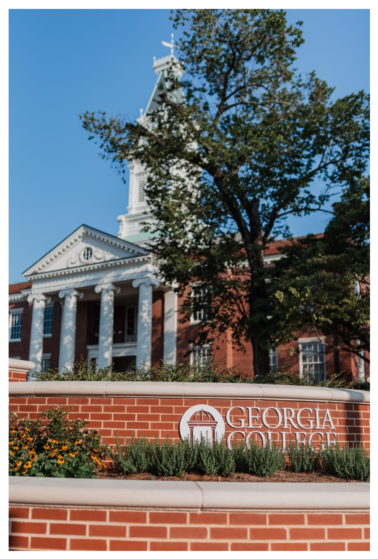
GEORGIA COLLEGE 5 FACULTY INFORMATION MANUAL