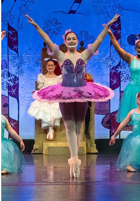
Pollichinelles Soloist, or another tutu