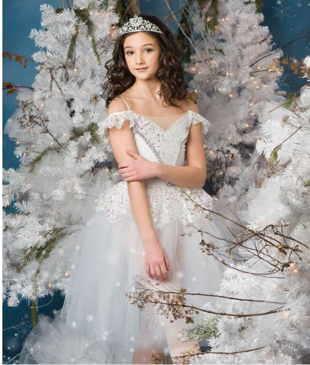
Kingdom of Sweet dancers - Dancers will wear the costume from their solo or class piece.