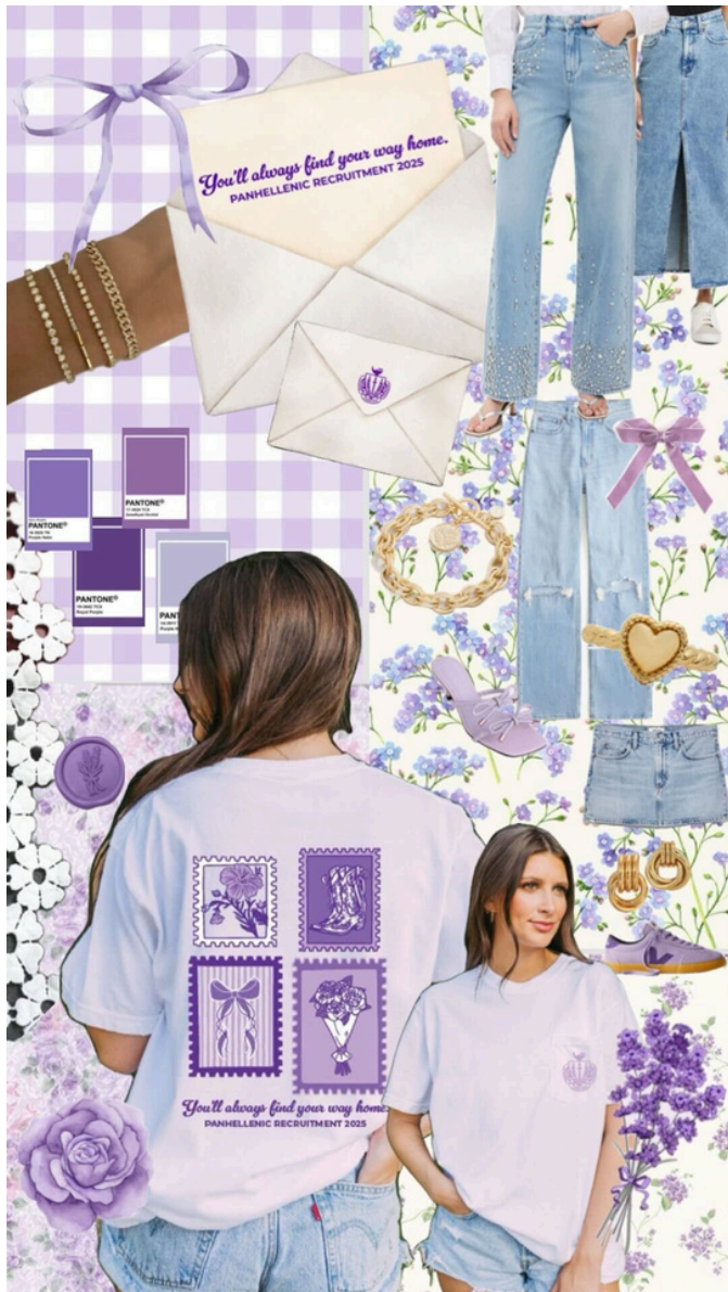
Shirt given by Panhellenic