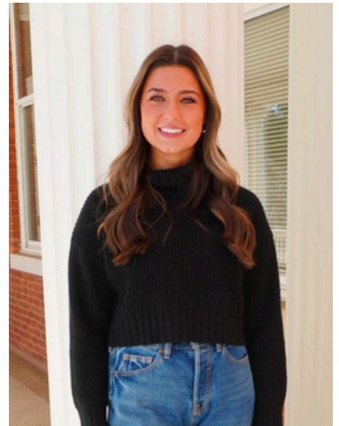
Campbell VP of Finance