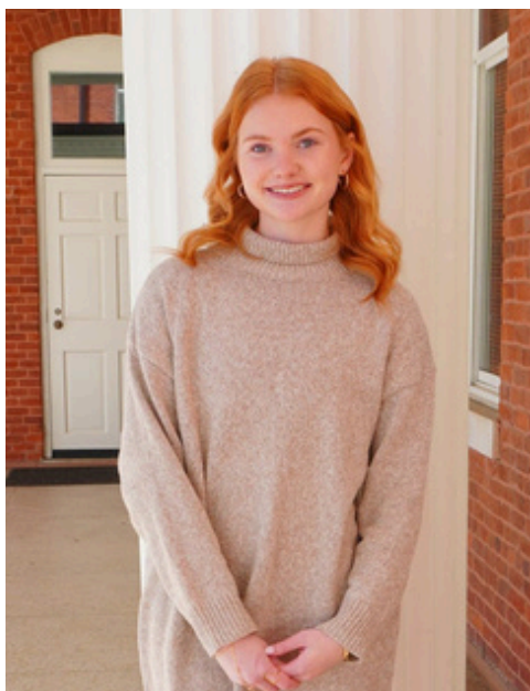
Freja VP of Programming