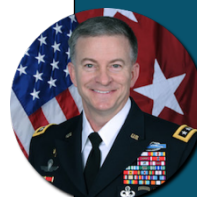
Lt. Gen. Burke Garrett Deputy Commander (ret.) U.S. European Command